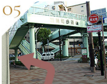
When you see the Kano-cho pedestrian bridge, continue to follow the road left.