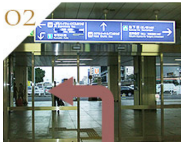
Exit from the station and turn left.