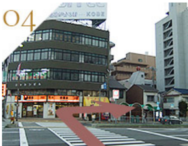
Cross the pedestrian crossing at the intersection, then turn right.