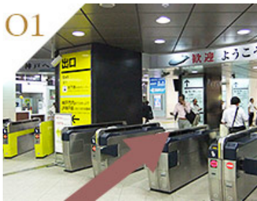
Take the escalator straight out of the exit.