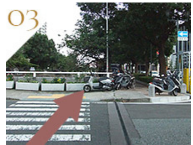
Cross the pedestrian crossing and go straight.