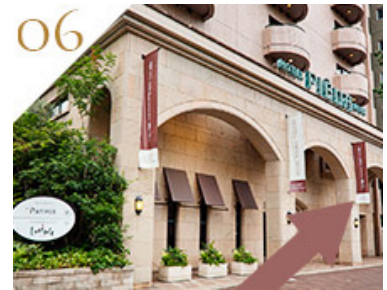
You'll see Hotel Piena Kobe soon after.