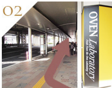
Go out to the ground and go straight ahead on the road "OVEN Lab." In the front.