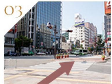
Go straight ahead with the taxi stand on your right.