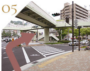
Cross the intersection with the pedestrian bridge, then turn right.