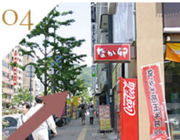
With "Nakau" on your right, go straight.