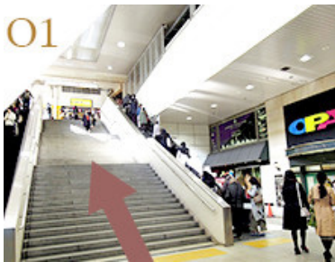
From the north exit, go straight and up the stairs.