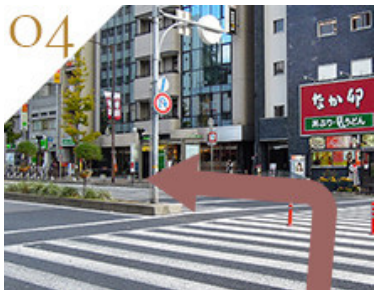
Cross the intersection and go straight ahead "Nakau" in front of you.