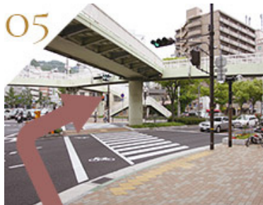
Cross the intersection with the pedestrian bridge, then turn right.