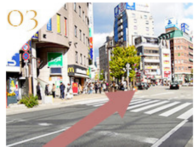
Cross the pedestrian crossing and proceed in front of McDonald's.