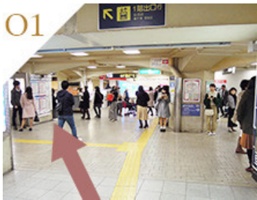
In front of the central gate, you'll see 'Nippon Travel Agency'. Turn right.