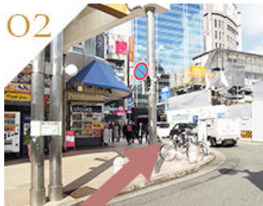
Cross the pedestrian crossing and go straight ahead.